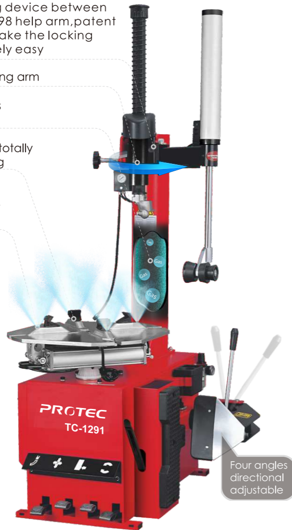
Four angles directional adjustable