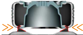
Outside clamping 10~21"